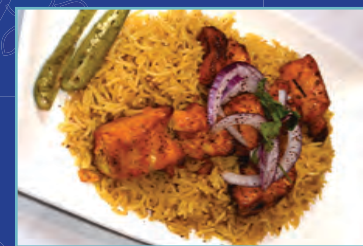
Chicken Breast Kabob