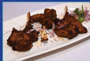
Chopan Kabob Skewer