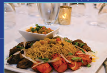
Kabob Combo #4